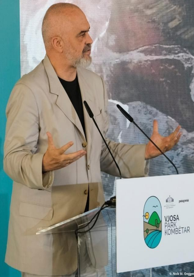
Prime Minister Edi Rama

"Under the protective cloak of the National Park, Vjosa will stay intact for Albania, for Europe, for the planet we want for our children's children."